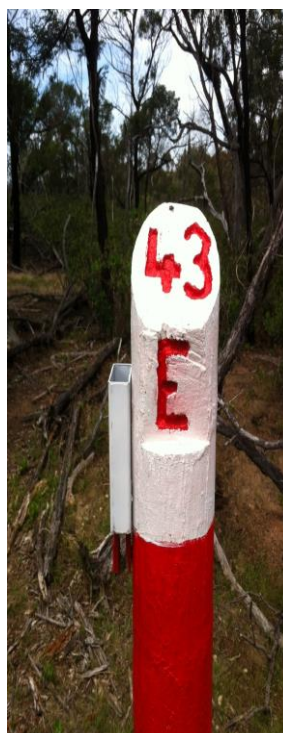
Red and White timber post You Yangs