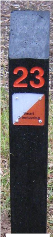
Front view of bollard Westerfolds

Park facilities include: Shelters, toilets, playground, drinking taps, maze of paths, small mob of kangaroos, Yarra River. Only contact Ranger if taking in 100+ people.