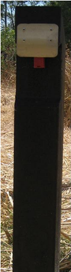
Rear view of bollard with punch and vandal proof plate Westerfolds